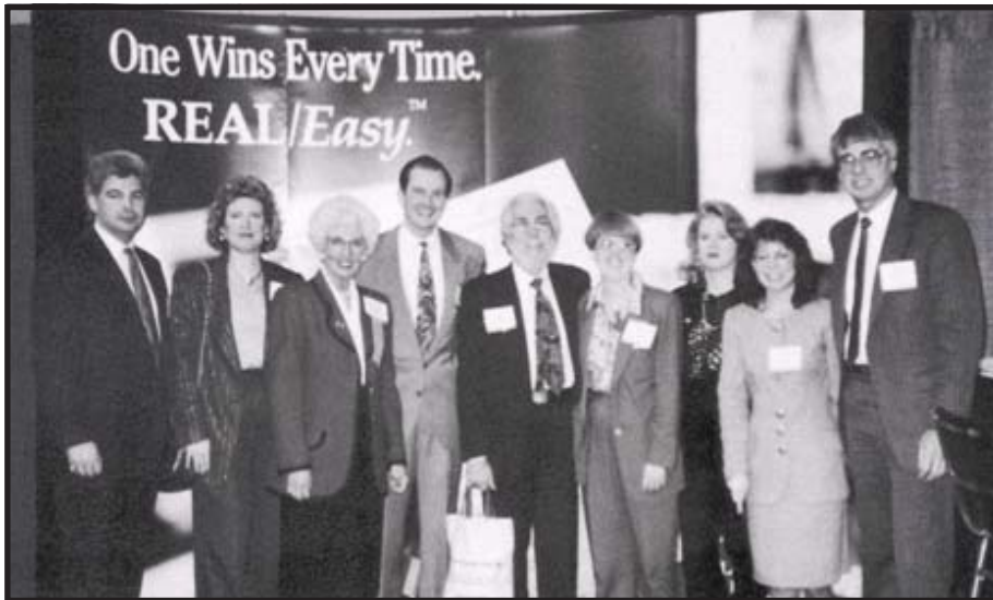
Customers Could View the New "Analysis" at the REAL/Easy Booth #1538 San Francisco

A lot of improvements have been made to REAL/Easy this year - not the least of which is the new "Analysis" reporting module.